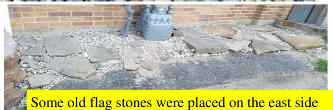
Some old flag stones were placed on the east side of the building by the driveway to help counter erosion.

The construction work is done! New rails have been installed, (the old ones had rusted out) matching stone walls on both sides of entrance, (no more damaged wall or wall with ivy growing between the stones) easy to maintain landscapes and better water drainage design. The tree was trimmed into shape and the sign given a fresh coat of paint. The old flag stone was also put to use. Now the pastor's entrance is ready to greet a backdoor guest.