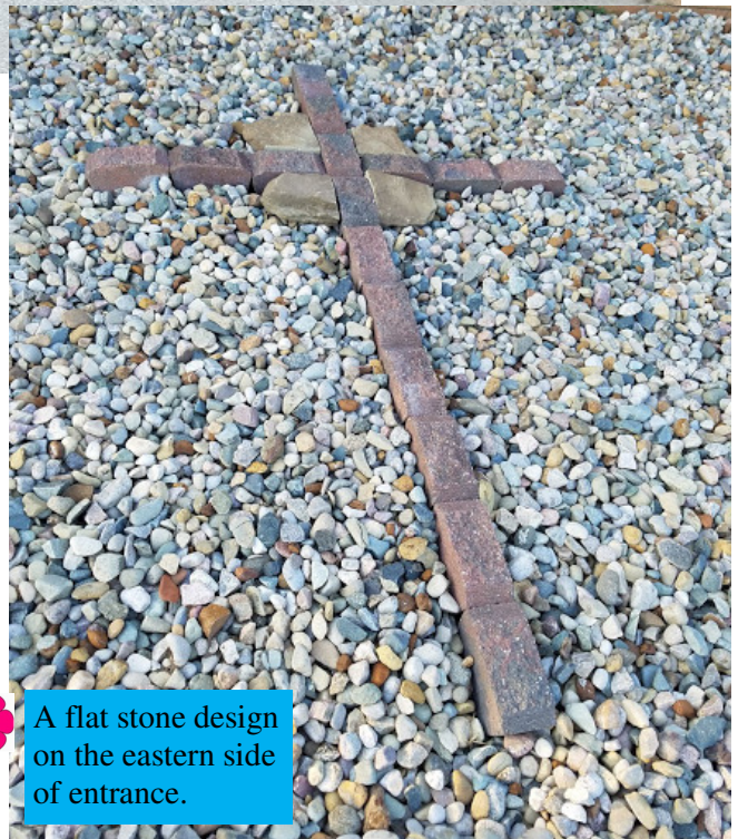
A flat stone design on the eastern side of entrance.

The construction work is done! New rails have been installed, (the old ones had rusted out) matching stone walls on both sides of entrance, (no more damaged wall or wall with ivy growing between the stones) easy to maintain landscapes and better water drainage design. The tree was trimmed into shape and the sign given a fresh coat of paint. The old flag stone was also put to use. Now the pastor's entrance is ready to greet a backdoor guest.